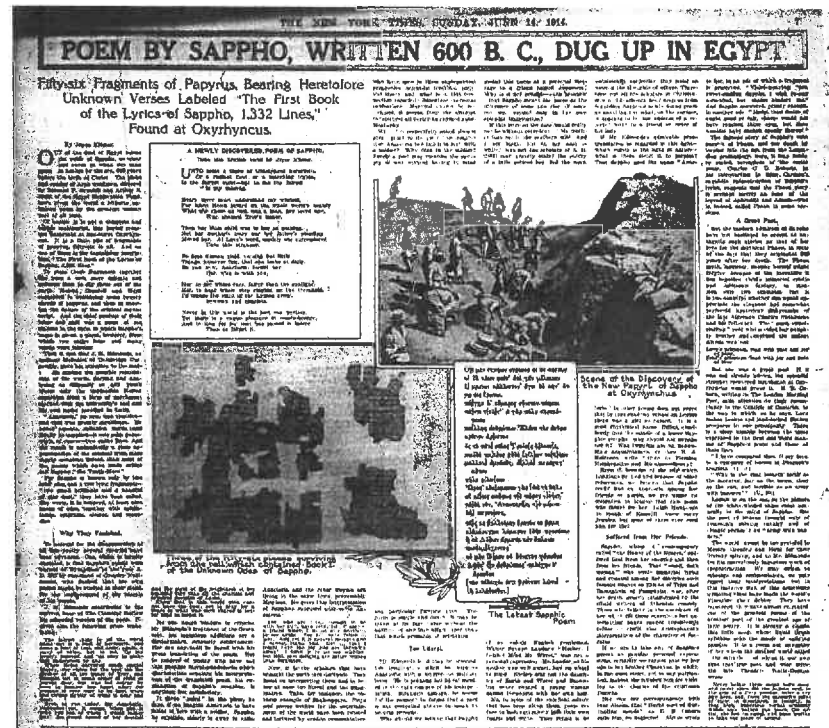
FIGURE 1. Joyce Kilmer, “Poem by Sappho, Written 600 BC, Dug Up in Egypt,” New York Times (June 14, 1914), 7.

To illustrate how a scrap of papyrus is recovered from the past and “almost recreated” as a song echoing in the present, the article includes a picture of men digging in the sand (“Scene of the Discovery of the New Papyri of Sappho at Oxyrhynchus”), a photograph of papyrus fragments (“Three of the fifty-six pieces surviving from the roll which contained Book I of the Unknown Odes of Sappho”), a reconstruction of the Greek