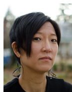
Seeing like a child Inheriting the Korean War