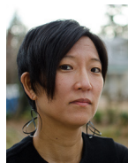
Seeing like a child Inheriting the Korean War